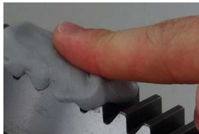
External dimensional control