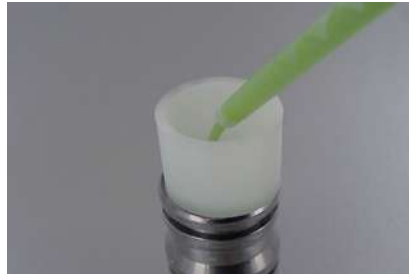
Internal dimensional control