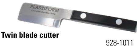
Twin blade cutter