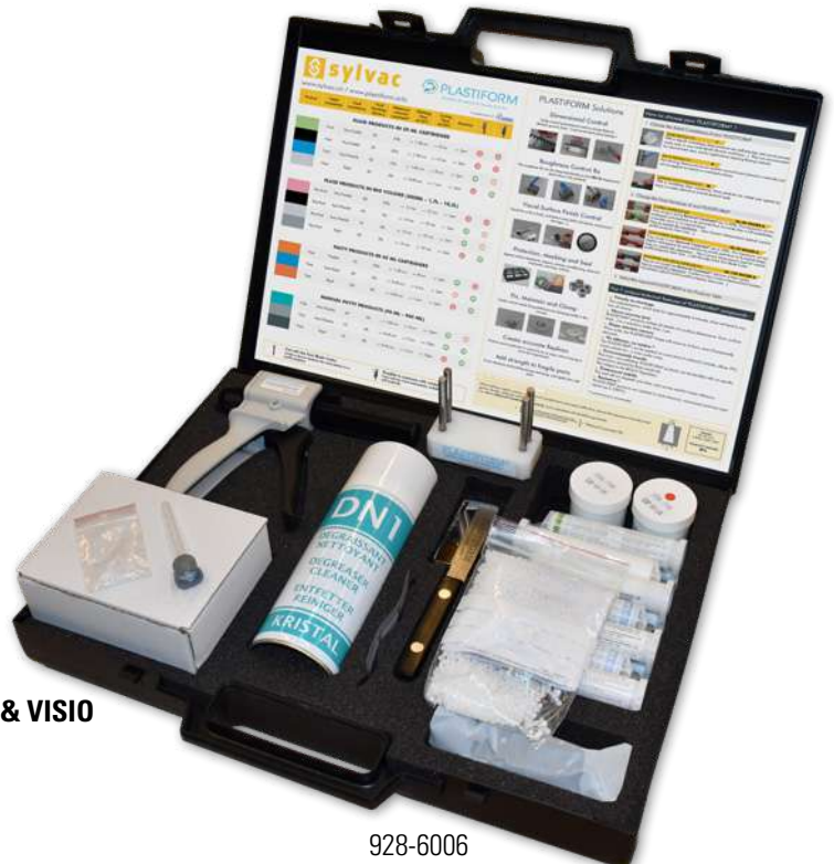
Special kit SCAN & VISIO