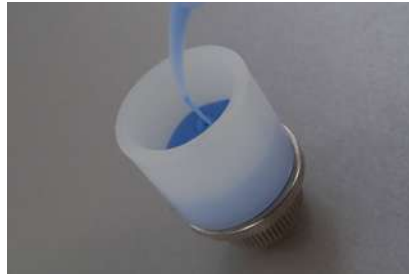
Internal dimensional control