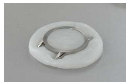
Fix, clamp, add strength to parts