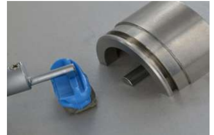
Roughness control Ra