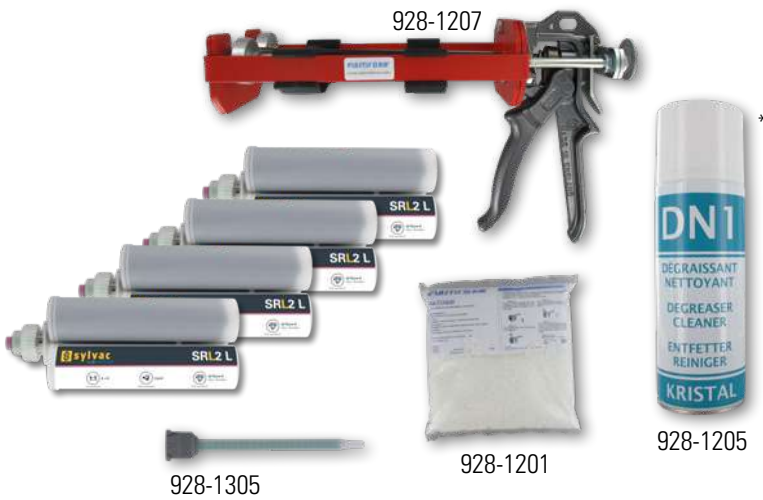
Example of content of a large volume kit (928-5001)