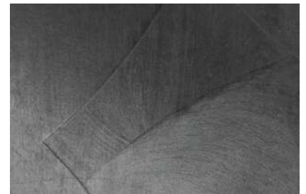
Visual finishing control