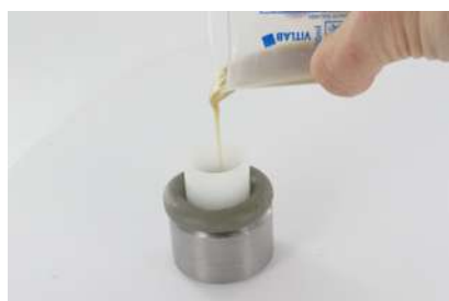
Custom protective cap