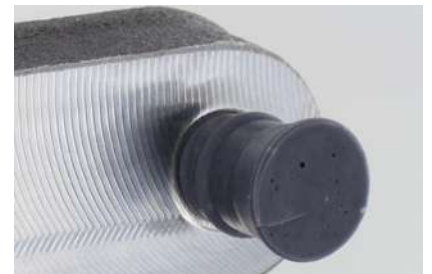
Protection, masking, seal