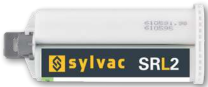
Cartridges 50ml and 400ml